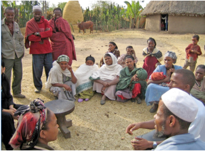
At the national, regional, and zonal/woreda levels, face-to-face meetings were mentioned as a preferred method of communication.