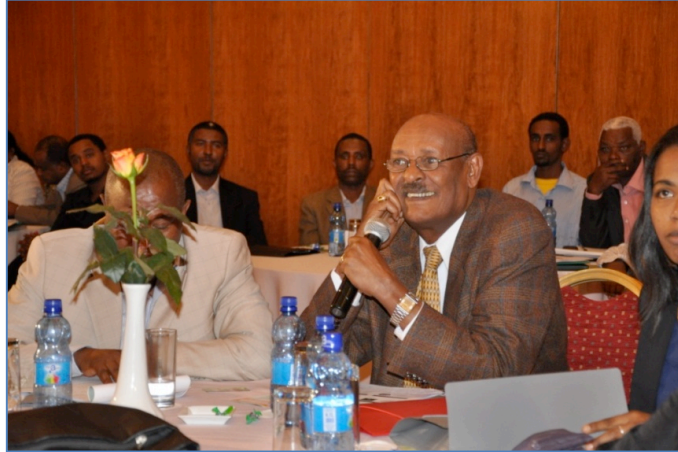
Participants ask questions during the K4Health Network Mapping (Net-Map) dissemination workshop in Addis Ababa, Ethiopia.

to funding of follow-on activities. Involving a range of individuals can help promote ownership of the study results among country-level stakeholders. Finally, presenting the methodology may encourage others to conduct needs assessments in other settings, to further address gaps in health information.